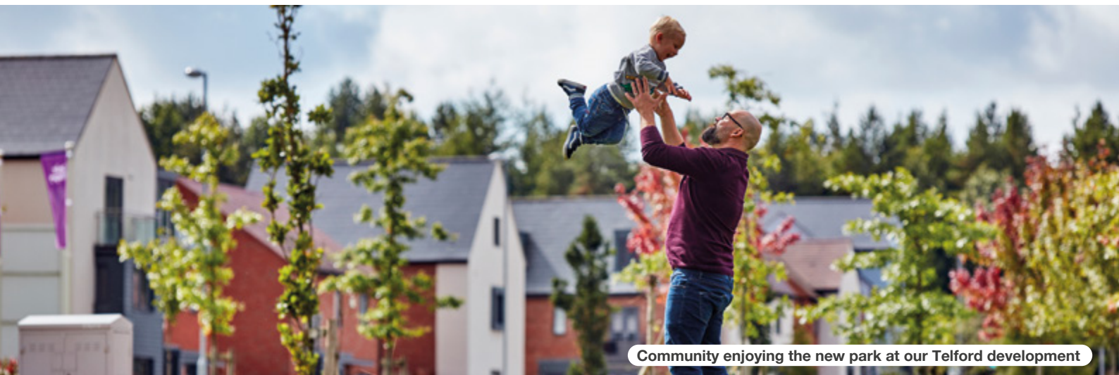
Community enjoying the new park at our Telford development